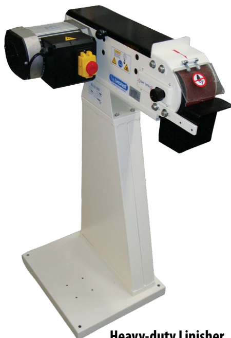
Heavy-duty Linisher Model: 1220/100/P1